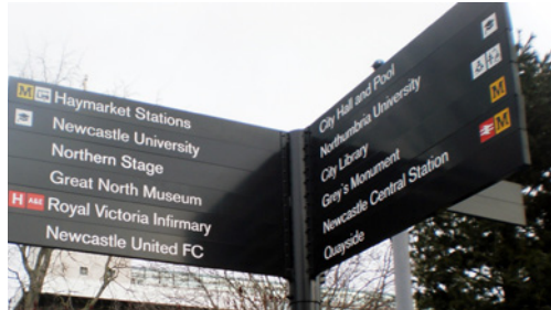
Fig 1: Signpost at Newcastle Civic Centre illustrating the proximity of both universities

The City of Newcastle is in the north of England. It is the unofficial 'capital' of the Tyne & Wear sub-region – which contains around 1 million people – with a population of approximately 278,000. Newcastle has two large universities and a significant student population. Northumbria University has over 34,000 students and Newcastle University around 20,000; during term time, 15-20% of the city's population is made up of students.