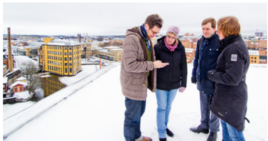
Fig 4: Members of the brokerage process meeting in Norrköping

The municipality of Norrköping in the east of Sweden has a population of approximately 130,000, and is the eighth largest municipality in Sweden. Linköping University [LiU] is a significant university in Sweden with approximately 27,300 students. The university has two campuses, one in its home city of Linköping, and one in the neighbouring municipality of Norrköping.